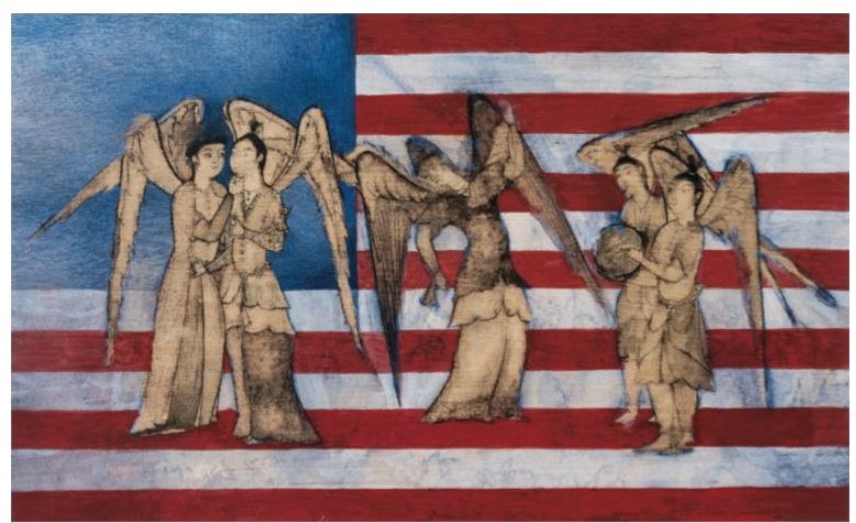
Shahzia Sikander, Utopia , 2003. Gouache on paper, 8 × 14 inches.