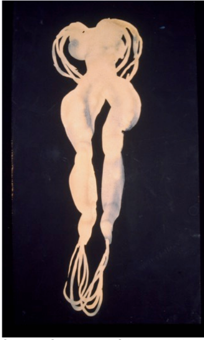
Shahzia Sikander, A Slight and Pleasing Dislocation , 1993. Gouache and gesso on board, 31 × 19 inches.

Rail: This brings up a tension that I sense in much of your work between beauty and violence. Some of the topics that you are grappling with, like the oppression of colonialism, or the power of the military, are painful to reckon with. Yet the works themselves are strikingly beautiful. Do you think about that balance at all?