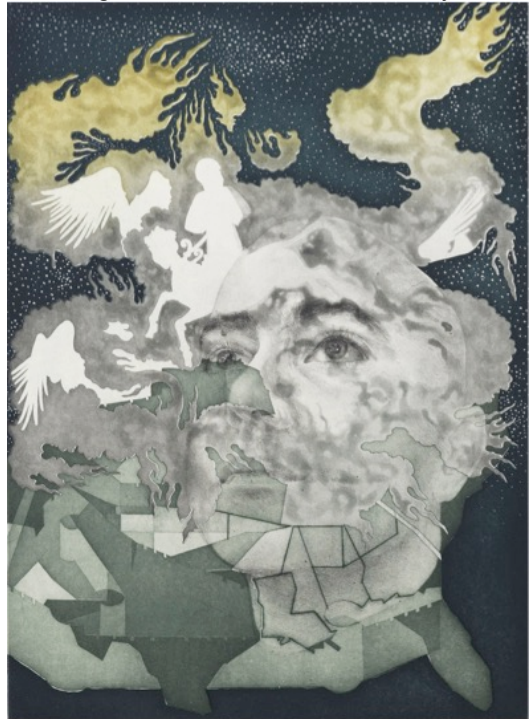
Shahzia Sikander, Portrait of the Artist , 2016. Suite of four etchings, 27 × 21 inches each. Edition of 40, published by Pace Editions, Inc. Courtesy Shahzia Sikander Studio.

Rail: Right, because short of a line-by-line translation, or even with that, you can't take it at face value.